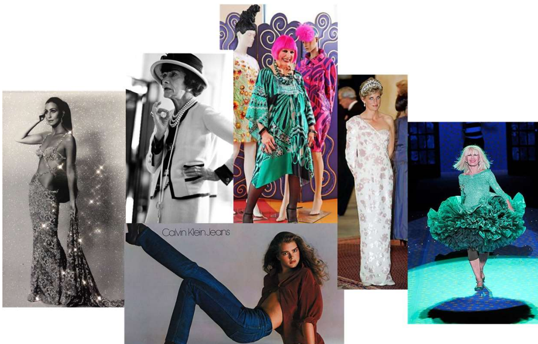
Above top: Cher wearing Bob Mackie, Coco Chanel, Zandra Rhodes, Princess Dianna wearing Zandra Rhodes and Betsey Johnson. Below: Brook Shields modeling Calvin Klein

The Turks weren't the only ones who wore turbans. Norma Kamali's love for turbans is well-known, and one day, she decided to organize a "Turban Tuesday" event. She wore a different, creatively wrapped turban every Tuesday for a year, sparking a trend among her friends and followers. Before long, turbans were making a major comeback as the go-to accessory for bad hair days, daring fashion statements, and beyond. I wore one myself along with my Norma Kamali inspired football sized shoulder pads which for better or worse made a bold statement in my home state of Nebraska.