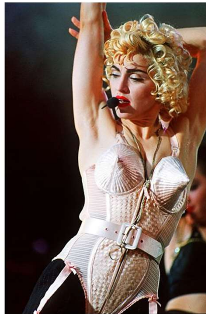
Right: Liberace, Left: Madonna